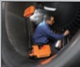
The fully extendable mast with 360° rotating head fits light in confined or open spaces